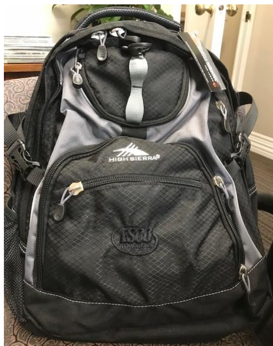
Backpack sent to each Scholarship Applicant